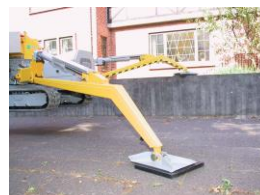
Easy set up