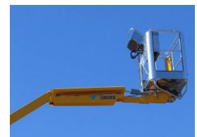
Fly jib (option)